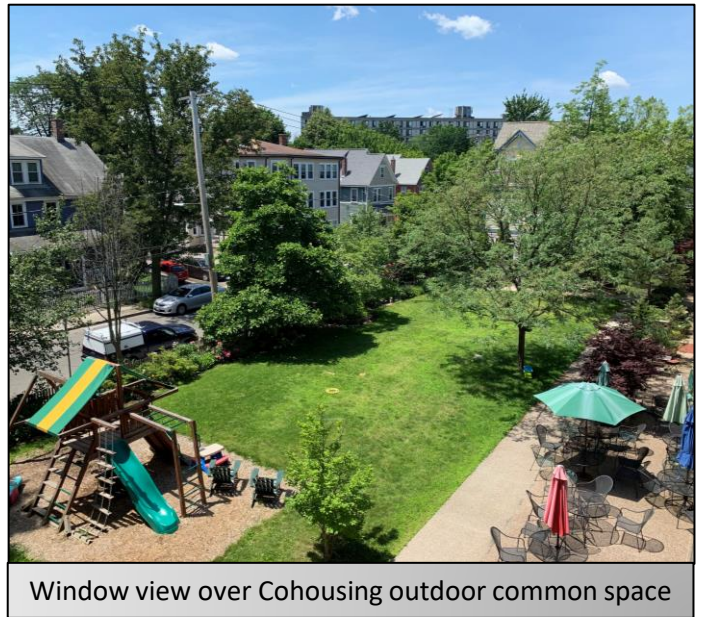
Window view over Cohousing outdoor common space

Want more Info? Contact Cambridge Cohousing Marketing & Resale representative: